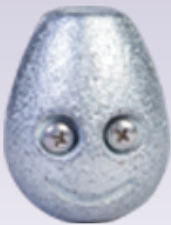
Weight MINI - WT2