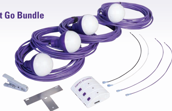
Each bundle comes with: