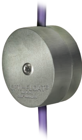
OPTI-FLOAT® Weight Stainless Steel