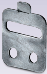
OPTI-FLOAT® Universal Attachment Bracket

For cable, chain or pipe. Easy to attach and remove.