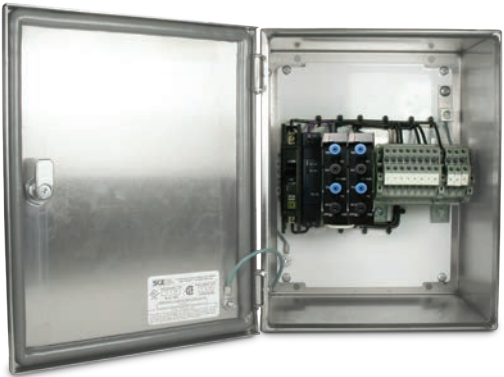
Retro Kit Enclosed Assembly

Retro-Kit OPTI-RK4SS (others similar) Retro Kit consists of Transceivers, Power Supply, Circuit Breaker, Terminal Strips, and padlockable Enclosure all pre-wired. 120VAC Input, UL Listed. Floats not included.