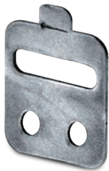
OPTI-FLOAT® Universal Attachment Bracket

For cable, chain or pipe. Easy to attach and remove.